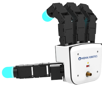
Allegro Hand V5(4F)