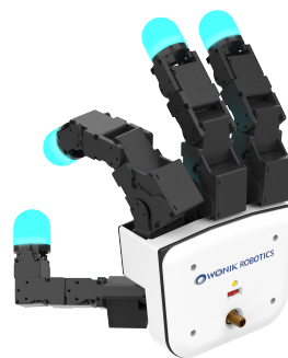
Allegro Hand V5(4F) Plus